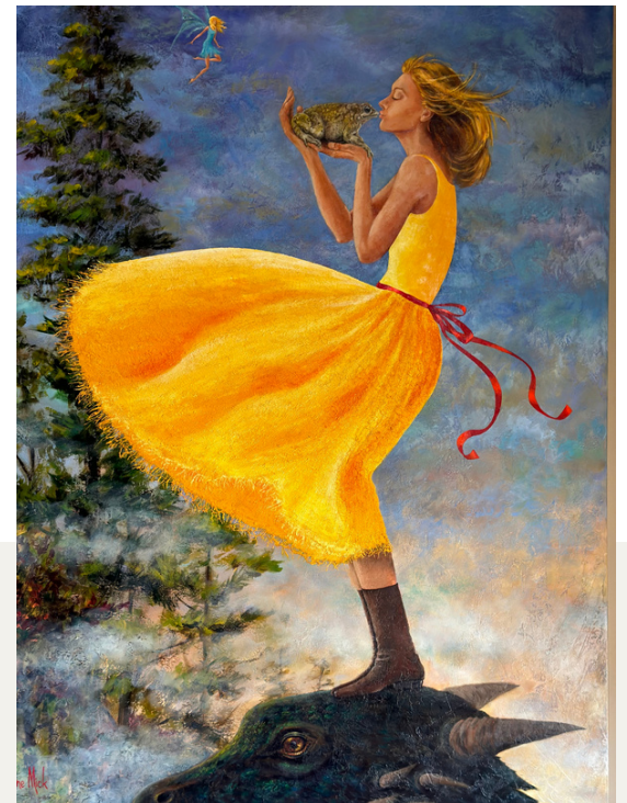
“Take the Leap”