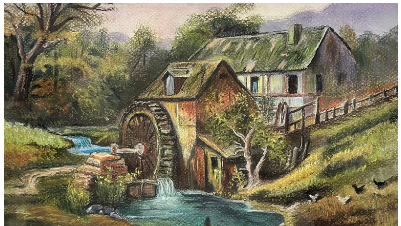
"Country Charm", by Vita Blumberg